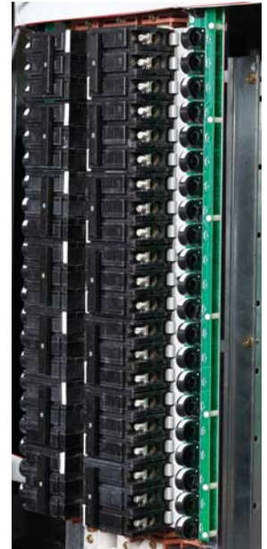
Optional CTs enable branch circuit metering.